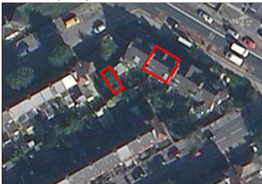
Aerial view for identification purposes only.