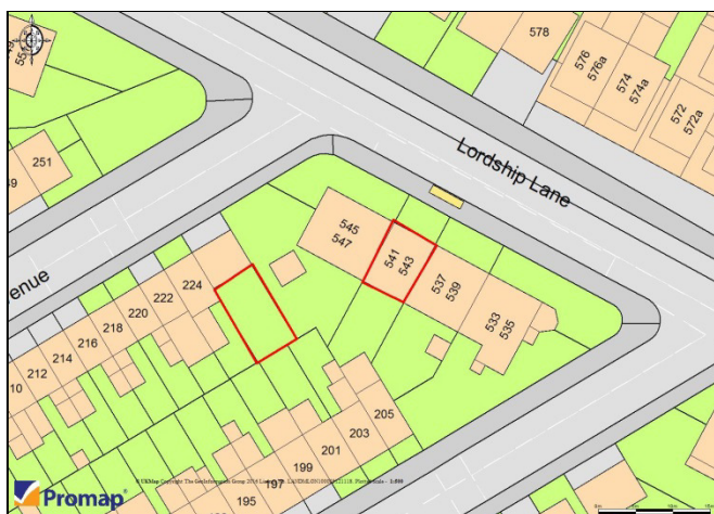
For Identification Purposes Only

Leasehold. Approximately 99 years remaining on the lease. Low ground rent. The property is being sold as seen subject to any tenancies that may subsist at the date of sale. Currently producing £28,680 per annum.